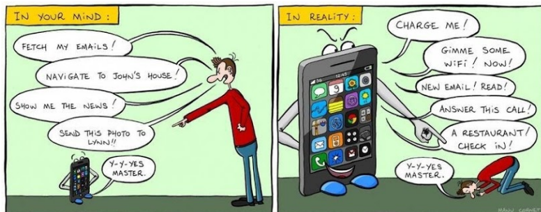
Figure 4. The gadget attracts interest because of its utility and cleverness, but the downside is the connectivity that obliges the user to give up privacy, suffer interruptions, and learn the protocols of use while being unaware of legal consequences. In Lacanian terms, this is “University Discourse,” where the Master (S 1 ) is concealed while the barred subject, $, is implored to “Enjoy!” (a) but in fact the gadget is enjoying the subject.

data-harvester, demanding our symbolic castration with every push of an ACCEPT button. Jouissance in this case is not simple, but it is undeniable. The lathouse puts it in a black box, quite literally, the one with a screen and keypad/board, or the aptly named Xbox that provides our fantasies to the surprisingly accurate logic of the pointçon , whose \diamond expands laterally, \langle \rangle , to open up the L-schema’s portal to connect A with Es, through a strategy of late or early. Time is not an issue, but the track is. The diamond shape of its tunnel