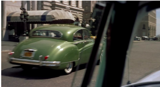
Figure 10. Continuing the green theme, Scottie follows Madeleine as she drives around San Francisco in her Mark VIII Jaguar. Her itinerary keeps Scottie “in line” and effectively idempotent so that his track will conclude perfectly and symmetrically at the witness chair where he will provide the testimony necessary for the coroner to conclude that (the real) Madeleine’s death was due to suicide.

knows where we are and what we are doing. It knows what we would like to buy and how our personalities have made us defenseless against certain marketing strategies. It harvests our personal data and sells it to third parties who make God knows what use of it. If Anselm had known about the Internet, he would have certainly used this feature to craft a new definition, pairing the lesser than of subliminal workings to the greater than of global algorithms. The aletheia of this alethosphere lies in its concealment and its infinite storage capacity. In exchange for our tic-tocs and Instagram selfies, the device digs deeper with algorithms than any hand can reach to expose our inmost thoughts to outmost strangers. We are conned by our little lathouse, we take it lying down, laterally , it wants our litter to be literal about it. The alethosphere will be where the litter always reaches its destination.