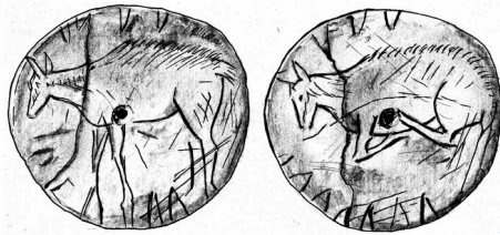
Figure 7. The thaumatrope is an ancient device, a round token with images that, when the disk is spun, combine. What is now just a toy was originally a form of prayer or magic invocation to affect a “before-and-after” cause and effect relation.

To keep The Truman Show palindrome balanced, the show had to order as many left-handed thefts from Peter as it needs to pay the righteous Paul, to keep the Euclidean fantasy moving about the idempotent dreamer, Truman. The historical number of isolation is forty, the customary designation of days and nights of rain, time spent in the wilderness, weeks of mourning or even gestation — whatever it takes to hold saint and sinner at arm's length long enough for the adamant poinçon to maintain audience share. The poinçon is a kind of screen, but it's also a portal when you split it into a less than and greater than, too early and too late. Refer to the L-schema of analysis, and think “This is the gimmick that connects to the unconscious as alethosphere and you will be on the right track, the trick-track. If Truman at least proves to your satisfaction the figure-ground reversal trick of idempotency, he will have done his job of showing the lathouse to be a thing of the scam, the con, the grift. Do not lose sight or “site” of this feature.