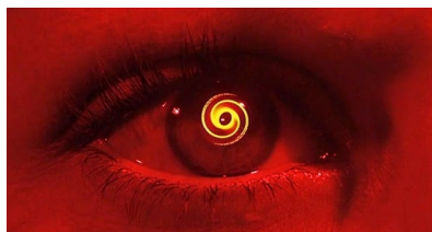
Figure 14. Vertigo , eye-spiral, title sequence.

Anamorphosis has come to stand for quite a lot in our analysis of Vertigo . First, it is the subjugation of a mark by a con. Second, it is a spin between two sides of a thing, a Judy/Madeleine shill function. Third, it is the creation of a “surface of pain” that Scottie cannot escape, because his arrow of Eros has been double-pointed. It has shot into two women, not one, but the one it hit for sure did not exist. When we understand the sky that Scottie takes for real as both a con and the cover of the redemption he may be dreaming in the final seconds of life, we don’t see half of what we think we see, or rather our understanding is (necessarily) mi-dire , a theory worked out under the law that it will be able say the truth as long as we do not say all of it . We recognize Scottie’s architecture, his “surface of pain,” when we connect his non-orientation and self-