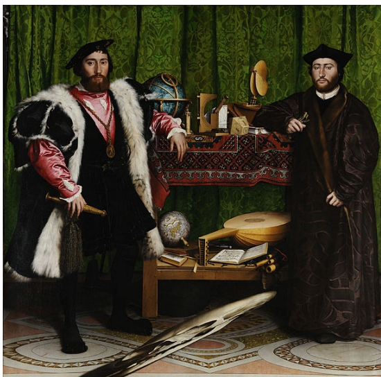
Figure 13. Hans Holbein, The Ambassadors , 1533, a double portrait of Jean de Dinteville and Georges de Selve. The National Gallery, London.

The issue of repetition is crucial to this move beyond a pure energetics model or a simple behaviorist model. The death drive satisfied, theoretically, (1) the relation to the brain’s neurological mandate of resisting disturbances and maintaining a low-energy flow — the “Nirvana” component; and (2) the automation of repetition evident not just in compulsive behavior but in language and thought in general. Who would imagine the next step? We locate this in Seminar VII, The Ethics of Psychoanalysis , where Lacan treats repetition as a “surface of pain” and connects it to the phenomenon of anamorphosis. Not coincidentally, he relates architecture to the formation of voids with lips that compel circling, often ritualized, that formalizes compulsion and repetition through ethnographic (ritual), artistic (baroque), and poetic (mythological) practices.