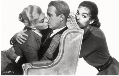
Figure 8. Thaumotropic logic is used in Hitchcock's Vertigo , when the actress Judy Barton plays Madeleine Elster, a rich heiress with suicidal tendencies. The retired detective, Scottie Ferguson, is hired by the heiress's husband, Gavin Elster, to create credible testimony once Elster has succeeded in faking his real wife's suicide. Scottie, falling in love with Madeleine, meets the actress later and tries to remake her in the image of his lost love.

to streaming services must pay to unlock stored contents, Lacan's terminology seems to be both apt and clairvoyant. As for "lathouse," the reference is both to latere , lying somewhere, lying around, flat, and ousia , the Greek for, as Lacan has it, something between the Other and "not altogether Being, but pretty close." I won't pretend this to be a precise definition, but as Lacan elaborates the gadget idea, he emphasizes that we could find lathouses lying on the path, behind windows, everywhere indeed where there is an object caught in the act of stoking our desire. The one thing that is certain, he says, is that if the lathouse exists, then anxiety well and truly has an object. One cannot hold the lathouse in position, it's in a space by itself, a portable non-space. Its space is the function of impossibility. Our aim here today is to show that a lathouse is as real as real can be, that it involves a trick, and that this trick will get you connected to the truth. Were there time enough we would tell about how Vico's thunder initiated