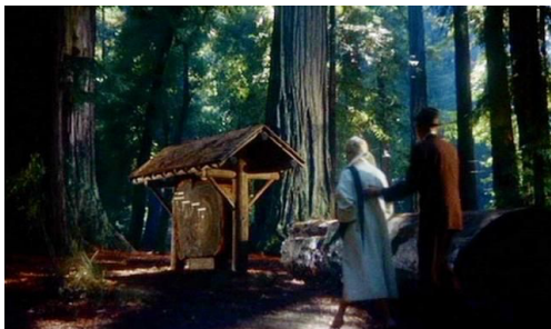
Figure 9. After Scottie rescues Madeleine from a suicide attempt, the two fall in love, insuring that Scottie will be even more vulnerable to her delusional relation to her dead ancestor, Carlotta Valdes. The color green dominates Madeleine's obsession with death; when the couple visit the giant sequoias (whose Latin name means "ever green") Madeleine rebukes the trees for their indifference to the continual passing of human life.

metaphor in the minds of those who first called themselves human, but for now we can simply remind all with ears to hear that the story on the screen commonly asks for nothing less, that our willing suspension of disbelief is our voluntary subjection to the negative jouissance of suspense where we accept all substitutions, meaning actors, and require only that the ending answer to the beginning, the condition of both the récit fort and après coup , the spin that winds every yarn into a Borromeo knot that will never bore but always borrow. "Borrow me-o" sings the tale told by an idiot, so that its sound and fury will move us without having us move an inch, thanks to our premature bury-me-o (on the lone prairie, in this case the real projective plane Lacan called architecture's "surface of pain" after explaining how Daphne, fleeing from Apollo, had no way to flee because she had everywhere to go — the idempotent dream). 8