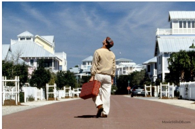
Figures 6. The Truman Show is a 1998 American comedy film directed by Peter Weir, produced by Scott Rudin, Andrew Niccol, Edward S. Feldman, and Adam Schroeder, and written by Niccol. The film stars Jim Carrey as Truman Burbank, a man who grew up living an ordinary life that — unbeknownst to him — takes place on a large set populated by actors for a television show about him. Eventually, he discovers the truth and decides to escape (Wikipedia).

connectivity of the Internet as a source of entertainment converge on the same psychic, or rather psychotic moment, for now we must accept the figure-ground reversal aspect of that paralysis. The field moves across our fixed, staring eyes. But, hasn't this always been the case? Paralysis is a normal part of movie going. Conventionally, audiences play dead in dark auditoriums for the duration of the film. Given that sleep truly does require a period of non-REM paralysis, during which all muscles except the heart and lungs are unplugged and limp; we dream thanks to a Euclidean momentum by which we experience moving about freely over fixed ground. Euclid too is a gadget, robbing the Peter side of invisibility to pay the Paul side of the appearing field. As with the Truman show, we only have to expose the gadgetry to prove that reality is but a dream, that in ordinary experience we are truly the static observer who robs the